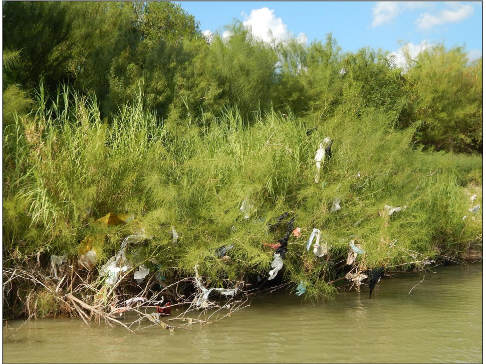
Figure 4: Tree Covered in Clothing Suspected to Have Been Left by Illegal Border Crossers along the Rio Grande in Laredo, Texas