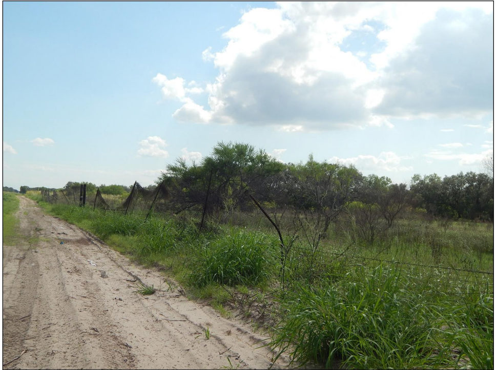
Figure 2: Damaged Fence Suspected to Have Been Caused by Illegal Border Crossers along Highway 281 in Brooks County, Texas