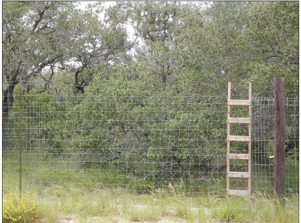
Figure 6: Ladder Reportedly Propped on Fence by Private Landowner to Discourage Damage in Brooks County, Texas

dragging can be particularly harmful to grapefruit trees, which are plentiful in south Texas. Some landowners in south Texas installed ladders along their fences to discourage illegal border crossers from damaging the fences in an attempt to circumvent Border Patrol. However, landowners told us that illegal border crossers are not using the provided ladders, and as a result, they are continuing to experience fence damage. See figure 6 for an example of a ladder along a fence we observed during our visit to south Texas.