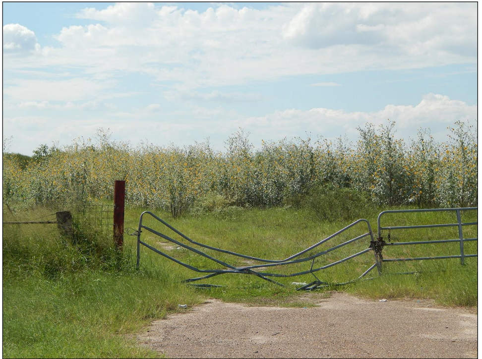
Figure 3: Mangled Gate Suspected to Have Been Caused by Illegal Border Crossers along Highway 281 in Brooks County, Texas