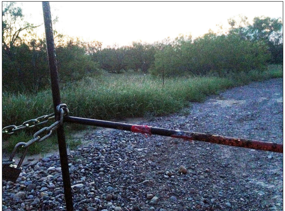
Figure 7: Red Tape on Landowner’s Fence Reminding Border Patrol Agents to Close and Lock the Gate

According to Border Patrol officials, Border Patrol agents generally adhere to what is referred to as ranch etiquette when working with the community and crossing onto private property. This entails treating private property and its owners and operators with respect and dignity while on patrol and conducting enforcement efforts. For example, agents are expected to stay on established roads, drive within established speed limits, seek oral permission from landowners before entering their property when appropriate, and close gates when leaving a property. In the Laredo sector, agents are to mark gates with red tape as a reminder to close gates when departing private property. See figure 7 for a picture of a gate with red tape in the Laredo sector.