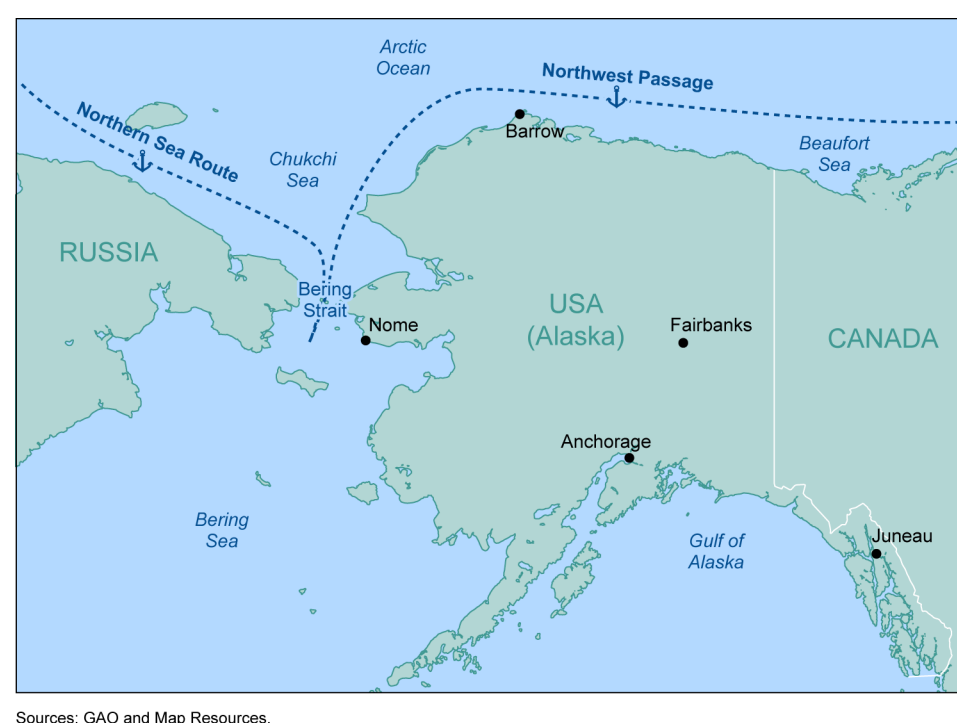
Figure 1: Alaska and Adjacent Bodies of Water