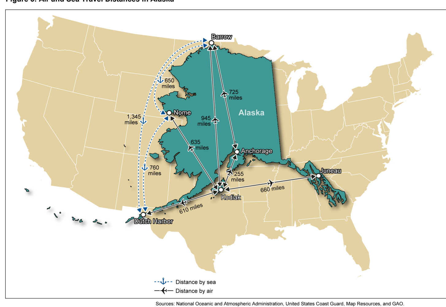
Figure 3: Air and Sea Travel Distances in Alaska