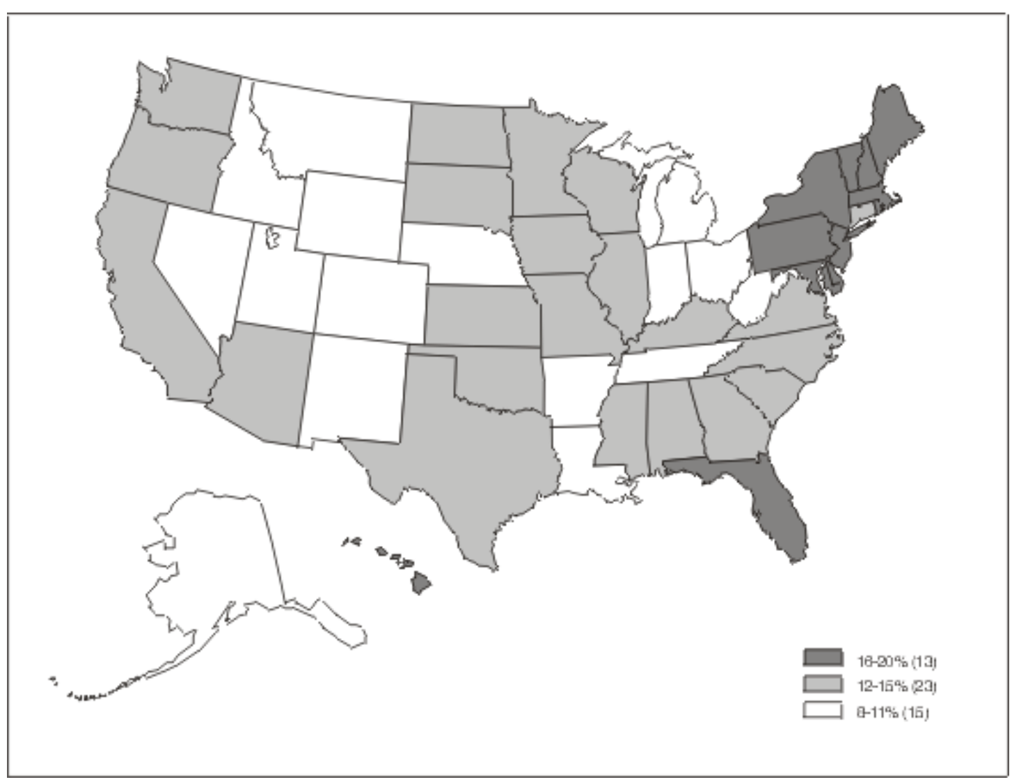
Figure 2: States Varied in Use Rates for Colorectal Cancer Services, 1999