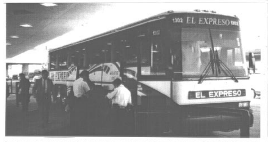
As passengers disembark in Laredo, they and their baggage are inspected by Customs and Immigration and Naturalization officials.