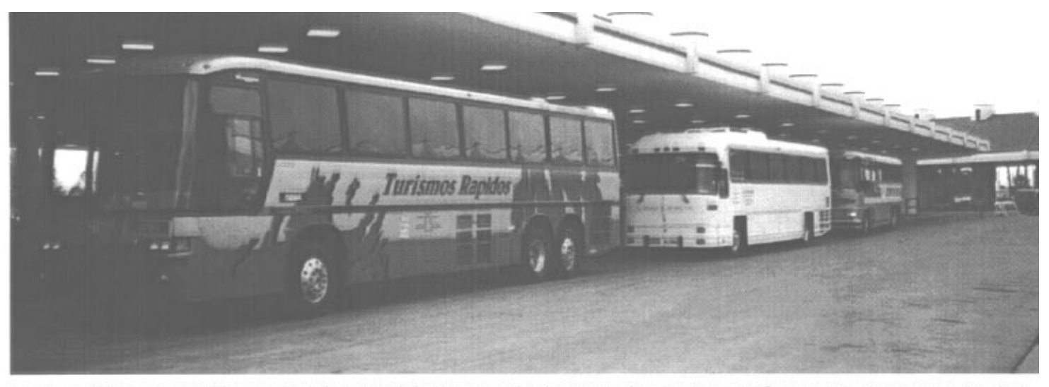
As commercial passenger vehicles pass through the Laredo border entry point, they stop under canopies on the Customs lot and passengers disembark.