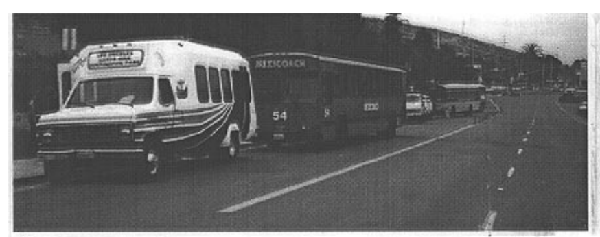
As part of its April 1997 strike force activity, California High Patrol officials conducted roadside inspections about a mile from the San Diego border crossing.