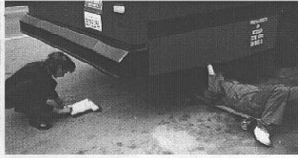
California Highway Patrol inspectors at the San Diego crossing conduct a level-1 inspection. The bus was placed on portable ramps to facilitate an undercarriage inspection.