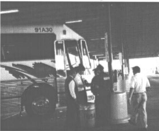
An FHWA inspector discusses inspection results with a vehicle operator at the Hidalgo crossing.