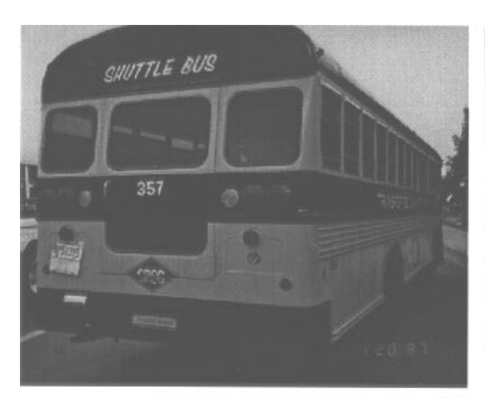
Figure 1: Types of Commercial Passenger Vehicles Providing Cross-Border Service From Mexico

and charter services beyond the commercial zones. However, these and other Mexican commercial passenger vehicles may operate to any destination within the commercial zones. Commercial passenger vehicles entering the United States from Mexico include motor coaches, minibuses, school-bus-type vehicles, and vans (see fig. 1).