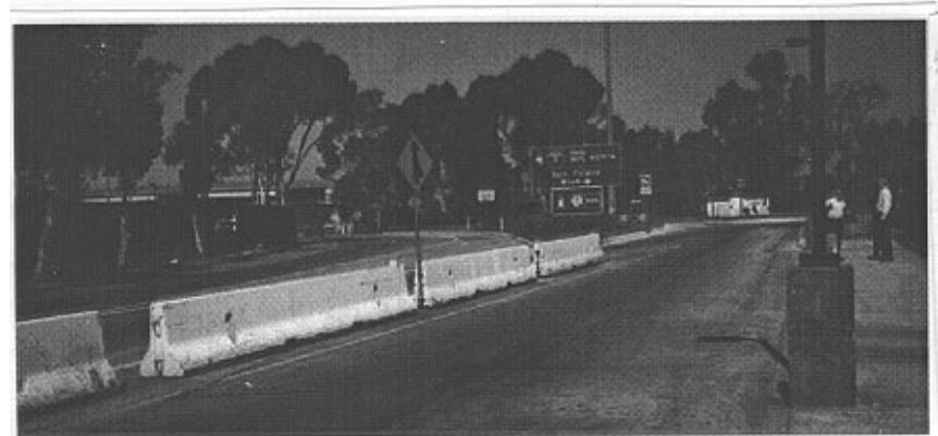
This narrow traffic lane, used by commercial motor vehicles while passengers clear Customs and Immigration and Naturalization, and a smaller adjacent area represent the only space that might be used to inspect commercial passenger vehicles at the San Diego crossing. About 46 percent of the northbound commercial passenger vehicle crossings entering the United States from Mexico occur at this location.