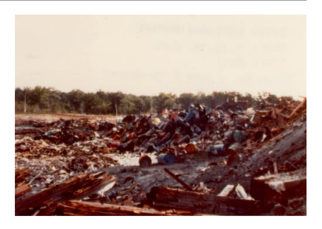
Figure 1: An SDMP Site in 1976

because controls exist to limit the public's access to contaminated areas. For example, they said fences and posted danger signs have been erected around contaminated property and buildings. In addition, they said the public has little reason to access areas that are obviously contaminated. However, we found that the extent of contamination is not always obvious. Figures 1 and 2 illustrate how a radioactively contaminated site appeared in 1976 and in 1994. Although the site appears to be cleaner in the 1994 photograph, it is not. The barrels of chemical and radioactive waste obvious in the 1976 photograph are still there but, over time, have been covered by top soil. And although most people probably have no reason to access property contaminated with radioactive waste, the representative for this SDMP site told us that hunters sometimes enter the property despite fences and signs alerting them to the danger.