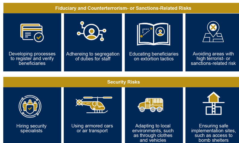
Figure 2: Examples of USAID Implementing Partners' Controls to Manage Fiduciary, Counterterrorism- or Sanctions-Related, and Security Risks in Nigeria, Somalia, and Ukraine

Source: GAO analysis of interviews with U.S. Agency for International Development (USAID) implementing partners; nexusbystock.adobe.com, chocostar/stock.adobe.com, GAO (icons) | GAO-24-106192