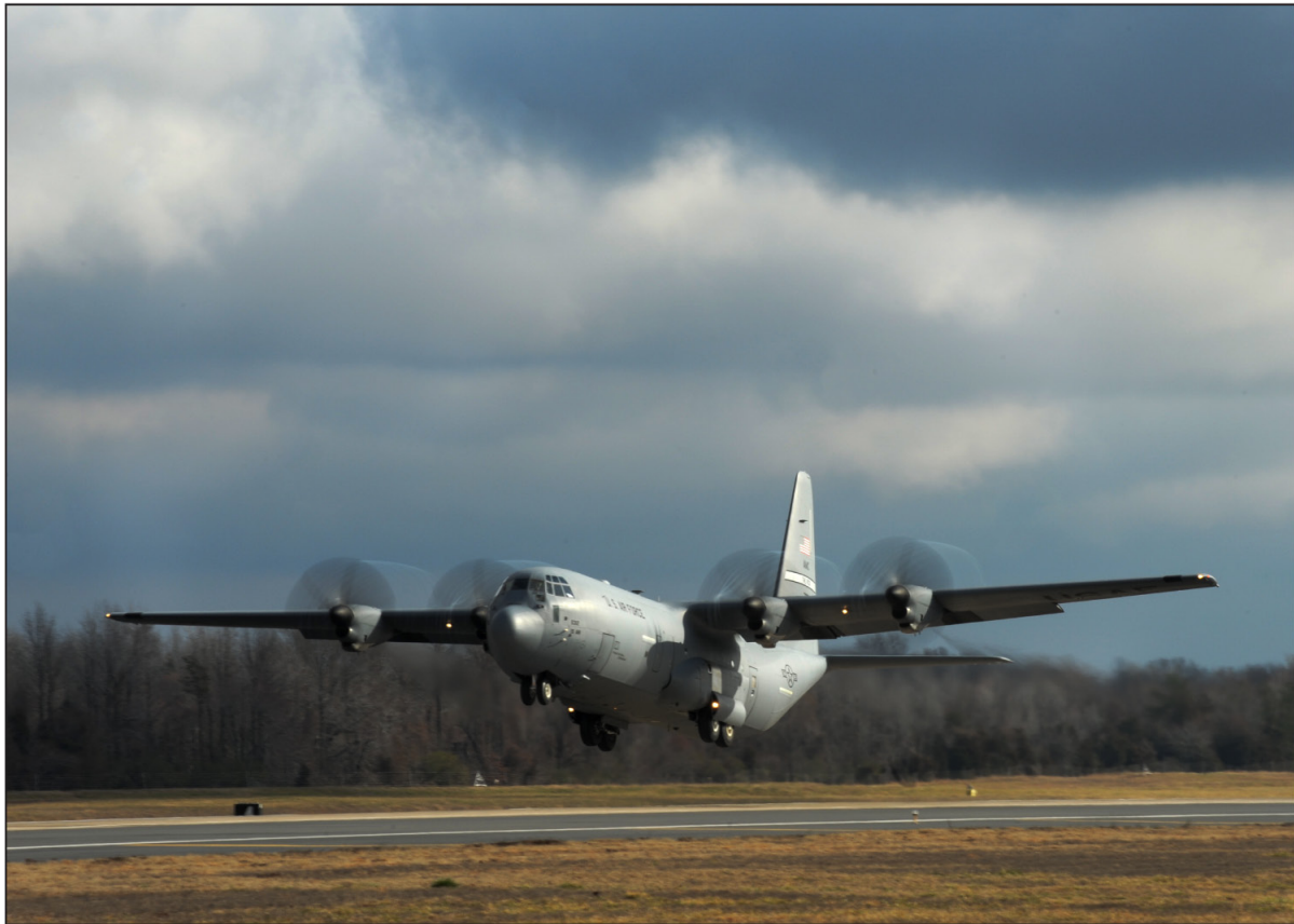
Figure 1: A C-130J Takes Off from Little Rock Air Force Base, Arkansas

Source: U.S. Air Force photograph by Airman Scott Poe. | GAO-15-637R