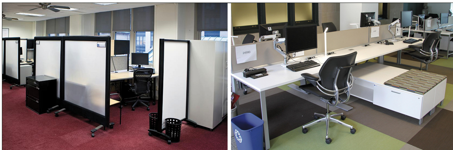
Figure 2: Images Showing the Configuration of GSA's Office Space before and after Renovating Its Headquarters Building