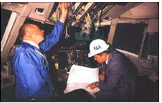
Figure 1: FAA Conducts Inspections as Part of Certification

FAA's Aircraft Certification Service (Aircraft Certification) and Flight Standards Service (Flight Standards) issue certificates and approvals for the operators and aviation products used in the national airspace system based on standards set forth in federal aviation regulations. FAA inspectors and engineers working in Aircraft Certification and Flight Standards interpret and implement the regulations governing certificates and approvals via FAA policies and guidance, such as orders, notices, and advisory circulars. (See fig. 1.)