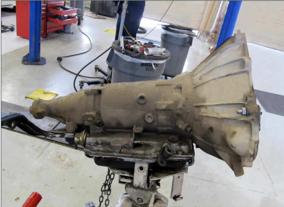
Figure 1: A Removed Remanufactured Transmission at a USPS Vehicle Maintenance Facility