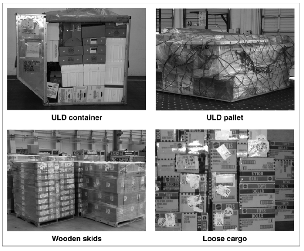
Figure 1: Various Means of Shipping Air Cargo