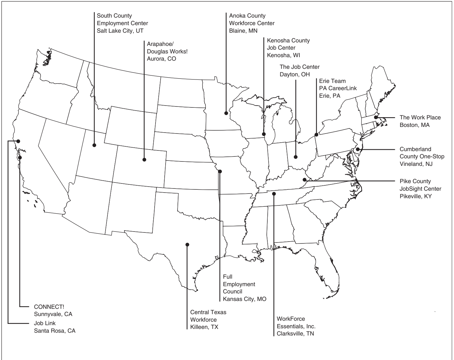
Figure 2: GAO Site Visits to One-Stop Centers