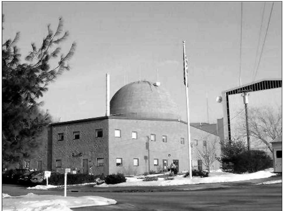
Figure 3: The Decommissioning Connecticut Yankee Haddam Neck Plant