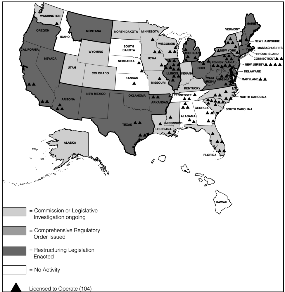
Figure 2: Map of Nuclear Power Plants in the United States and Status of Deregulation by State

Note: Includes Browns Ferry Unit 1, which has no fuel loaded and requires Commission approval to restart.