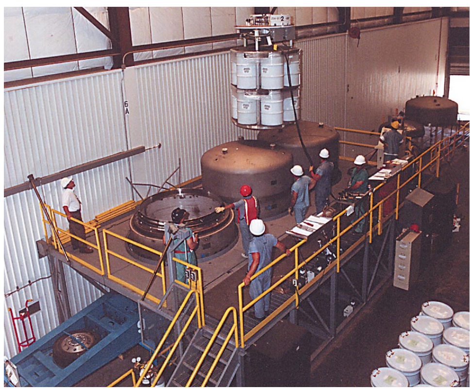
Figure 3: Workers Load 14 of the 55-Gallon Transuranic Waste Drums Into a Transportation Cask

will provide additional casks on a "best efforts basis, considering the schedules and requests from other sites." Other DOE sites, also under pressure to ship their waste by specific dates, will be competing for use of the casks. Figure 3 shows workers loading drums into a transportation cask.