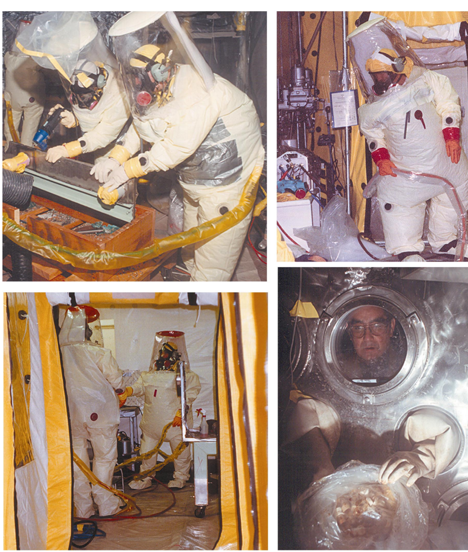
Figure 1: Workers in Protective Clothing Handling Plutonium-Contaminated Equipment