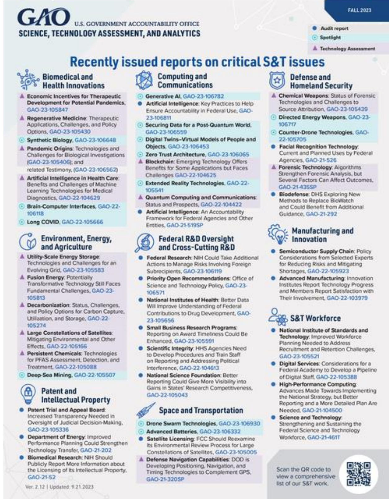
Figure 4: Examples of Recently Issued Reports on Critical Science and Tech Issues (including Technology Assessments)