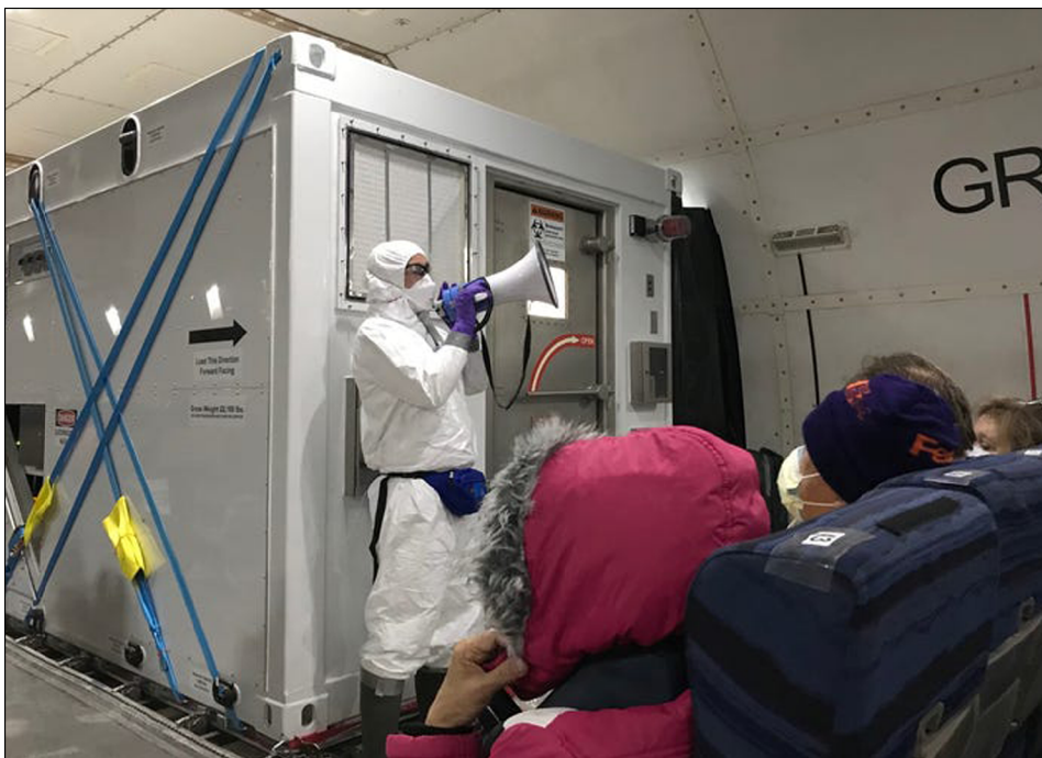
Figure 3: Department of State Staff Provide a Safety Briefing to Diamond Princess Cruise Ship Passengers on a Repatriation Flight, February 17, 2020

Source: Department of State. | GAO-21-334