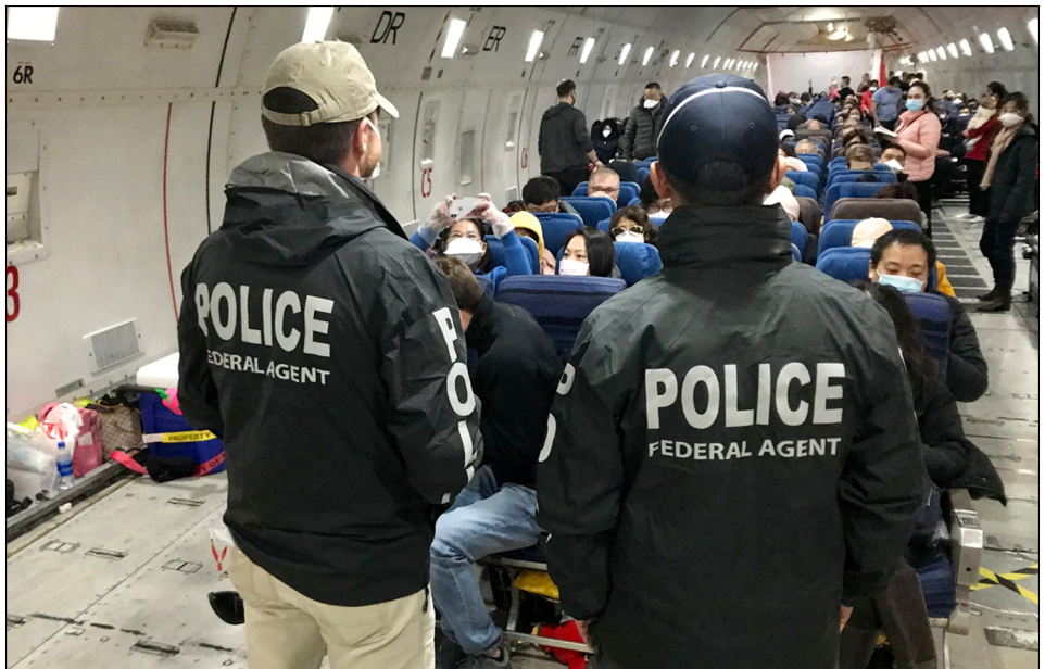
Figure 2: Department of State Staff Assist Repatriates Aboard the First Repatriation Flight Out of Wuhan, China, January 29, 2020

GAO-21-334