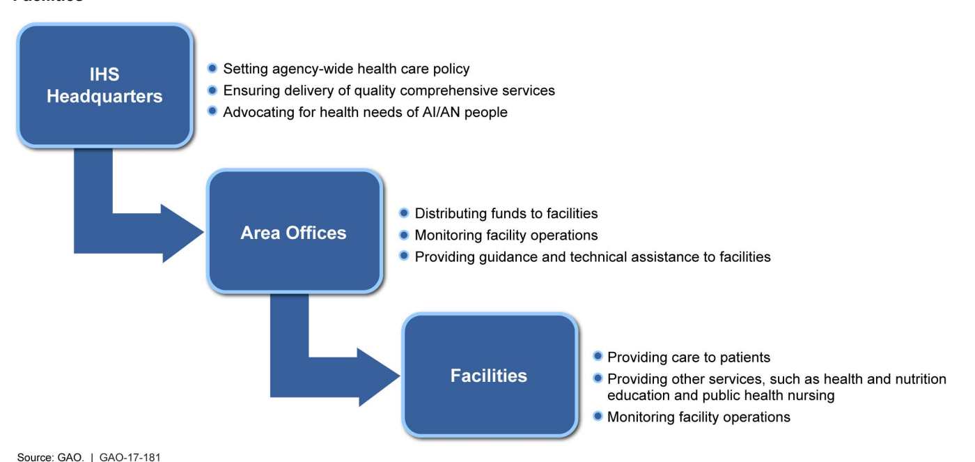
Figure 2: Health Care Responsibilities of Indian Health Service (IHS) Headquarters, Area Offices, and Federally Operated Facilities

According to IHS, its mission to raise the physical, mental, social, and spiritual health of Al/AN people to the highest level cascades through every organizational level and individual in the agency. This cascading method of accountability is often used by health care organizations with a decentralized management structure and is recommended by the Office of Personnel Management (OPM) for agencies with clear organizational