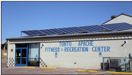
Figure 1: Examples of Facility-, Community-, and Utility-Scale Solar Energy Projects on Tribal Lands

A 192-kilowatt solar photovoltaic system was installed on the Tonto Apache Tribe's Fitness and Recreation Center in Arizona. The installation was part of a 2014 project co-funded by a DOE grant.