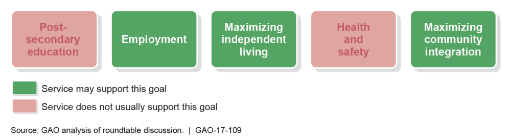
Figure 16: Roundtable Views of Goals Supported by Vocational Supports

Vocational supports may facilitate employment for youth with ASD. Examples include: