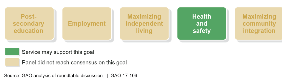
Figure 3: Roundtable Views of Goals Supported by Behavioral Services

Behavioral interventions are treatments intended to help autistic youth develop skills and reduce challenging behaviors. Behavioral interventions may include, for example, identifying the reason for challenging behavior and teaching a positive behavior as a replacement, step-by-step teaching and practicing of skills, or teaching awareness of thoughts and feelings in order to manage responses to them. One specific intervention, Applied Behavior Analysis, uses a structured system of rewards to reinforce the desired behavior and has been the subject of extensive research. Panelists strongly disagreed about its efficacy in adults.