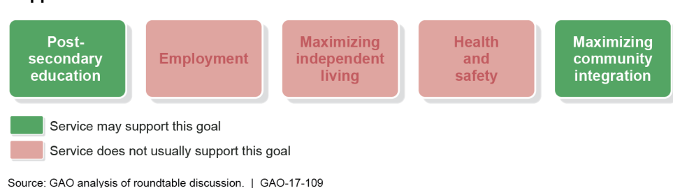
Figure 11: Roundtable Views of Goals Supported by Postsecondary Education Supports

Postsecondary education supports are intended to help youth with ASD succeed in a variety of postsecondary settings, including community colleges, 4-year universities, and vocational or technical schools. Academic supports include, for example, extended test-taking time, assistance with note-taking in class, and delivery of instructional material in various formats to support differences in learning styles. In addition, education supports can help autistic youth with skills such as organization as self-advocacy, which can also be important to success in