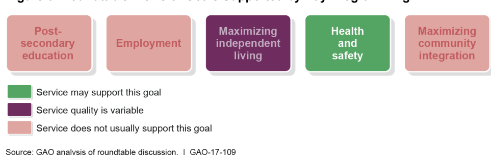
Figure 6: Roundtable Views of Goals Supported by Day Programming

Day programs provide supervision and activities for individuals who have exited the school system. Some are designed to provide instruction in life skills, community activities, or therapy, but the panel said that their actual operations are highly variable and more often segregated from the community.