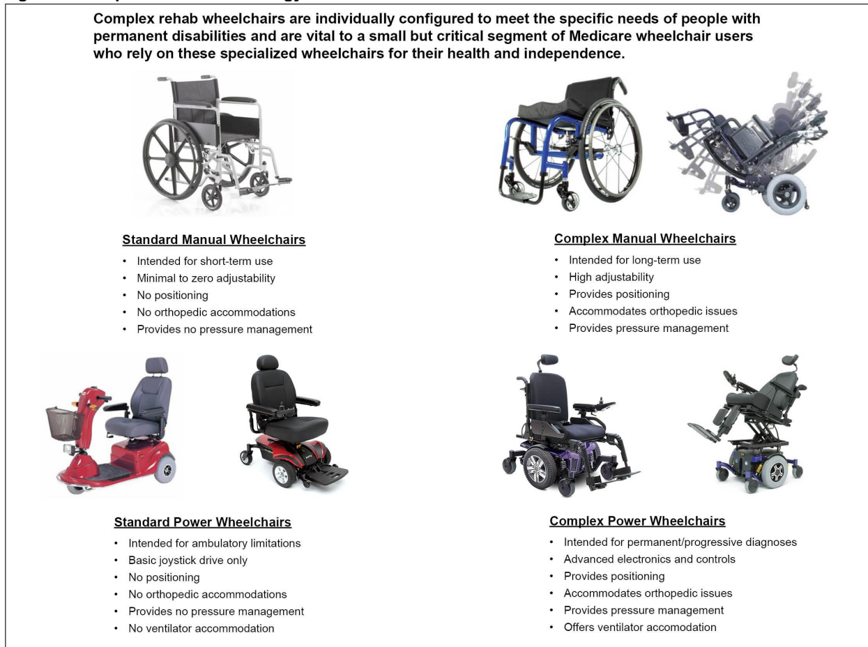
Figure 1: Complex Rehab Technology Wheelchairs Differ from Standard Wheelchairs

GAO-16-640R