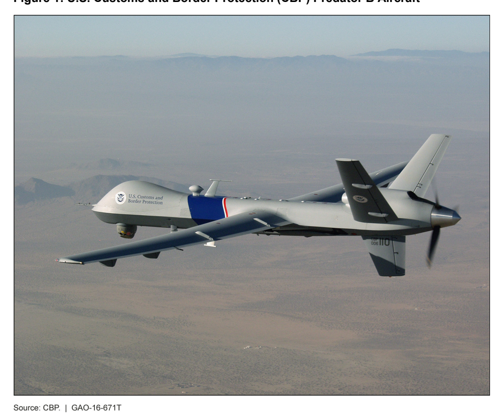
Figure 1: U.S. Customs and Border Protection (CBP) Predator B Aircraft

CBP's Predator B aircraft may be equipped with video and radar sensors utilized primarily to support the operations of other CBP components, and federal, state, and local law enforcement agencies. <sup>16</sup> CBP's Predator B operations in support of its components and other law enforcement agencies include patrol missions to detect the illegal entry of goods and people at and between U.S. POEs and investigative missions to provide aerial support for law enforcement activities and investigations. For example, CBP's Predator B video and radar sensors support Border