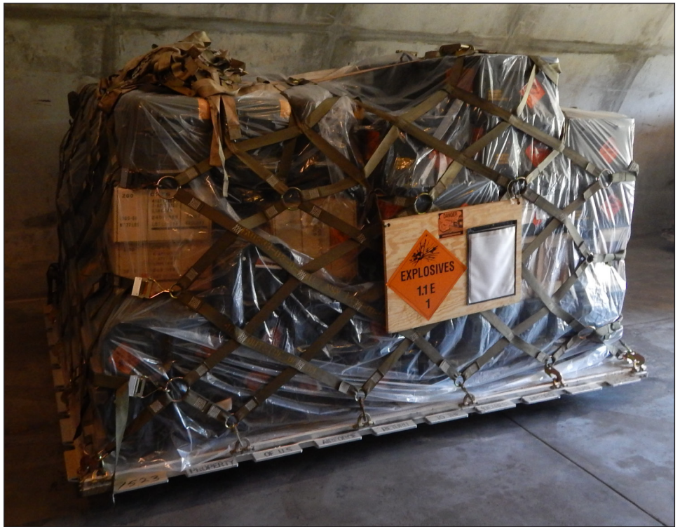
Figure 2: Security Risk Category I Ammunition Ready for Rapid Deployment and Verified in Army Systems