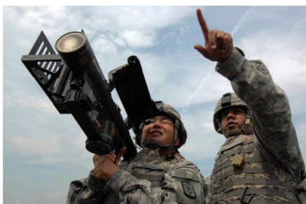
Figure 3: Selected Security Risk Category I Ammunition