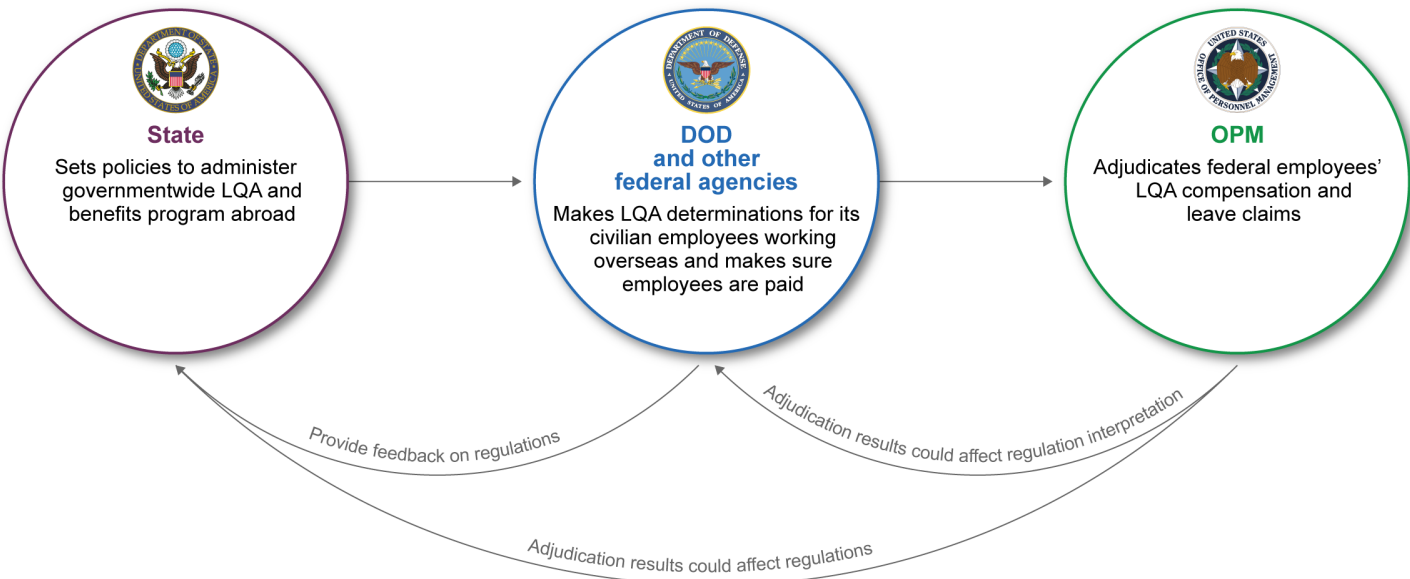
Figure 1: Department of State (State), Office of Personnel Management (OPM), and Department of Defense (DOD) Roles and Responsibilities for Living Quarters Allowance (LQA)