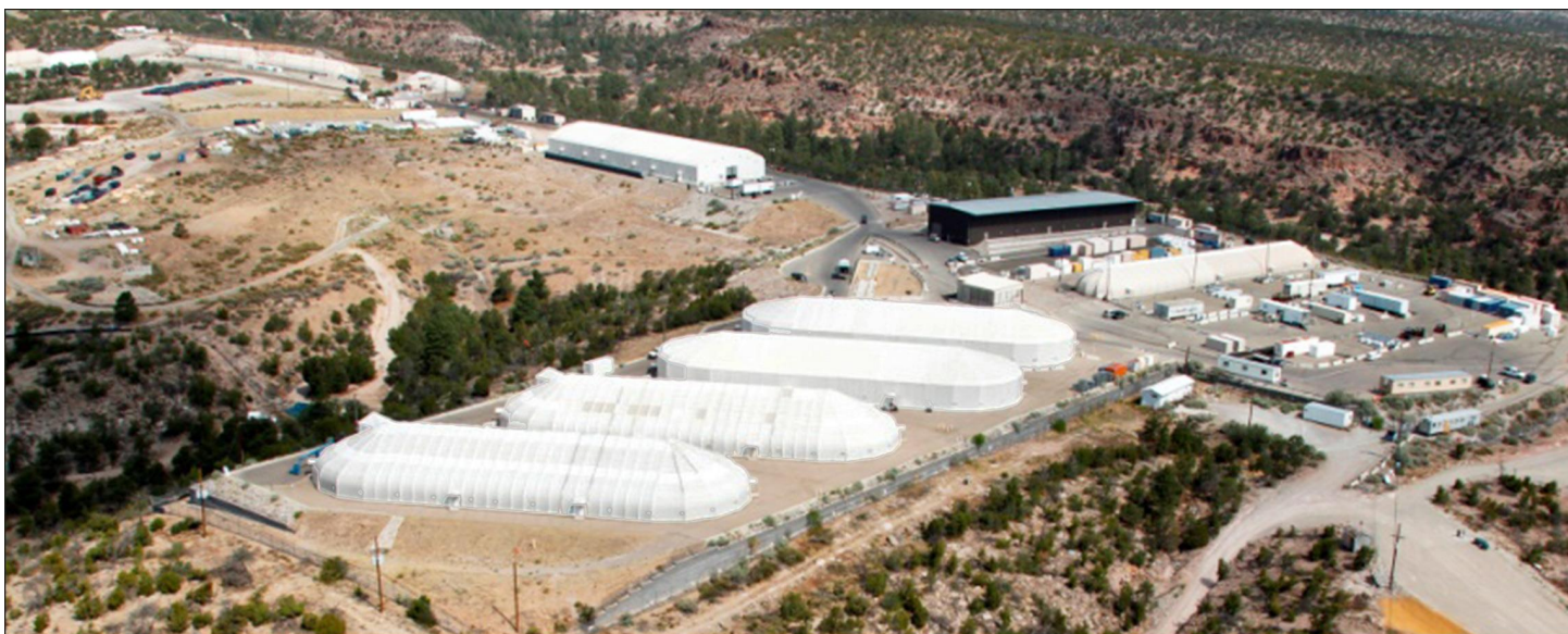
Figure 1: Aerial View of Area G at Los Alamos National Laboratory

Source: Los Alamos National Laboratory. | GAO-15-182