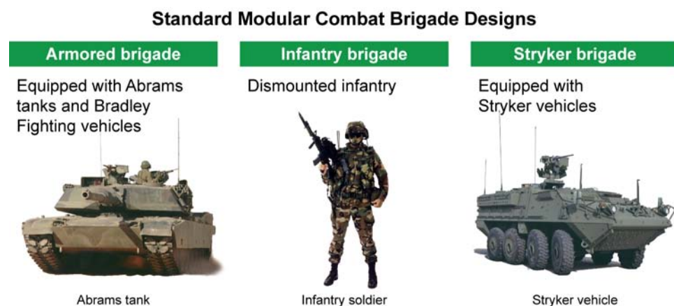
Figure 1: Standard Armored, Infantry, and Stryker Brigades