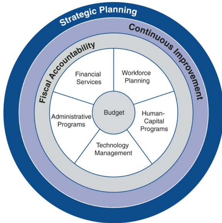
Figure 1: GAO's Integrated Management Process