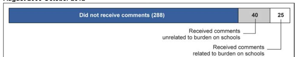
Number of Postsecondary Education Information Collection Notices that Received Comment, August 2006–October 2012