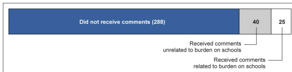
Figure 1: Number of Postsecondary Education Information Collection Notices that Received Comment (August 2006-October 2012)