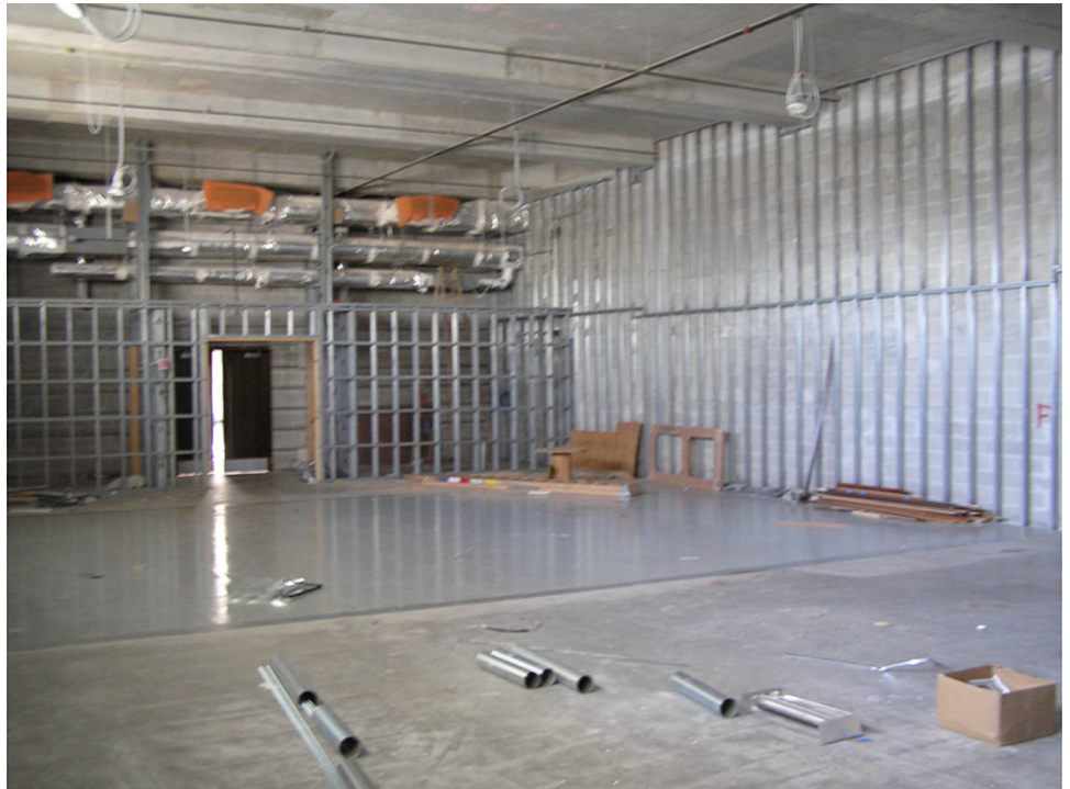
Figure 4: One of Two Unfinished Courtrooms in the Ferguson Courthouse, as of 2009

Of the 33 courthouses built since 2000, 28 have reached or passed their 10-year planning period and 23 of those 28 courthouses have fewer judges than estimated, including the Ferguson Courthouse. As we reported in June 2010, for these 28 courthouses, the judiciary has 119 fewer judges than the 461 it estimated it would have, resulting in approximately 887,000 extra square feet. In the Ferguson Courthouse, the judiciary estimated in 2000 that it would have 33 judges in Miami by 2010; it had 27 at the time of our report. This has resulted in 57,000 extra square feet of space, including space for 2 courtrooms that were never finished (see fig. 4).