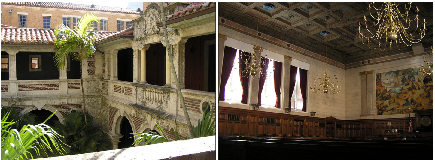
Figure 2: The Center Courtroom Entrance and Interior in the Dyer U.S. Courthouse

The Ferguson Courthouse is an example that includes all three causes of extra space. It contains approximately 238,000 extra square feet of space, which we estimated increased the construction costs by $48.5 million dollars in constant 2010 dollars and costs an additional $3.5 million annually to rent, operate, and maintain. In addition to building the Ferguson Courthouse larger than necessary, the judiciary has abandoned the historic Dyer Courthouse, which has remained vacant since 2008, with its 10 courtrooms (see fig. 2). Considering the extent of the extra space built, it is unclear if the Ferguson Courthouse would have been necessary had the judiciary retained use of the Dyer Courthouse.