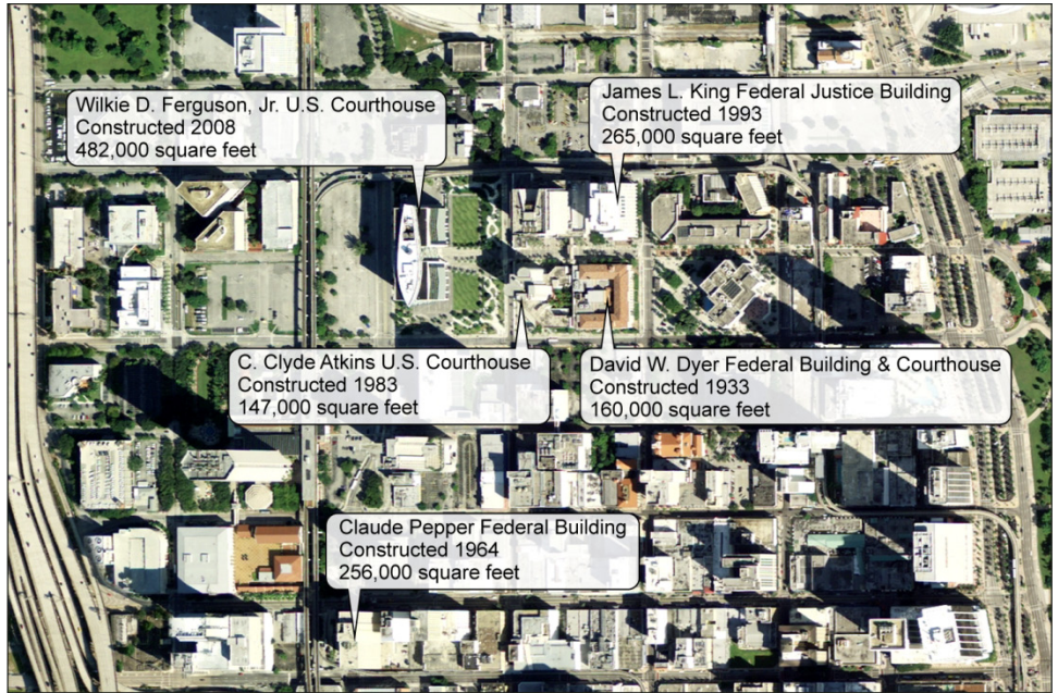
Figure 1: Location of Federal Judiciary Buildings in Downtown Miami, Florida