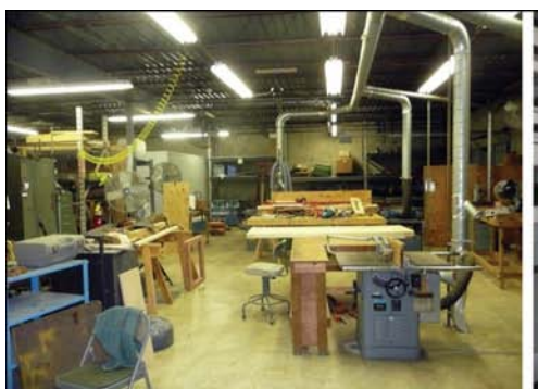
Figure 8: Examples of Spaces Used by Interior at a Leased Site

In other cases, an agency's mission may dictate the need for a specialized facility that could make colocation inappropriate. For example, USDA officials in a few regions told us that farmers often drove farm vehicles, including tractors, to Service Center locations and that in these cases, underground parking in a federal building would be problematic. In addition, we visited a leased Interior site that required a blacksmith and carpentry shop, cold storage for artifacts, and parking for large maintenance vehicles, such as wood-chippers and industrial mowers (see photos in fig. 8 below). An Interior official said that these needs would have to be taken into account to share space. None of these details are included in the FRPP, but local and regional officials from several agencies noted that they can speak readily on how mission needs and facility details may impact colocation.