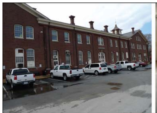
Figure 5: Building 1 at the Philadelphia Navy Yard: Exterior, Interior Unfinished, Interior Finished

We also observed spaces that would need potentially costly specialized repairs or renovations. For example, some of the U.S. Navy properties we visited at the mixed-use Philadelphia Navy Yard (see fig. 5) would need asbestos abatement and water damage repair. Navy officials told us that the properties could be leased from the Navy by other government agencies, and that some agencies have made inquiries to do so. However, they said that the agencies were alarmed by the complexity and costs of repairs, which effectively ended any further consideration of the properties for colocation. Had any agencies pursued leasing the properties, Navy officials said they likely would lack sufficient up-front financing. In addition to general and specialized renovation costs, Navy officials said DOD Unified Facilities Criteria (UFC) requirements prescribe certain antiterrorism measures, such as blast-proof windows and security gates, which can further elevate the costs of renovations to DOD-owned buildings, both on and off-base.