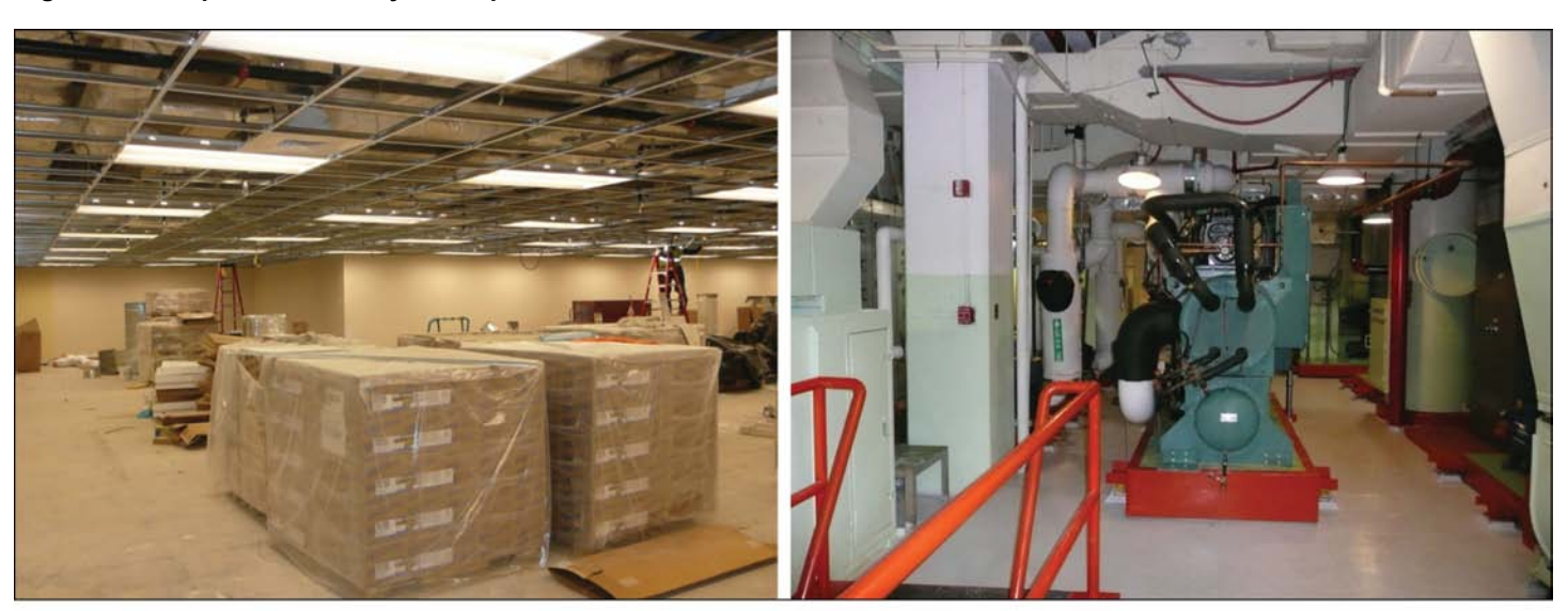
Figure 7: Examples of Federally Held Spaces Described in the FRPP

The FRPP does not capture when "underutilized" buildings are under renovation (left) or when spaces cannot be occupied, such as areas used for environmental systems at an underground facility (right).