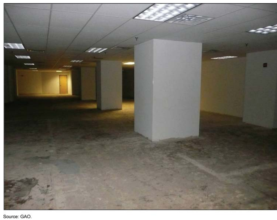
Figure 3: GSA-Held Vacant Space in Dallas, Texas

Colocation Could Yield Service-Delivery Efficiency and Cost-Avoidance Benefits in Some Cases