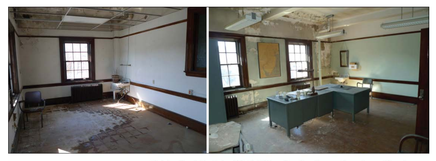
Figure 4: Vacant USPS Space in Easton, Pennsylvania, Requiring Renovation

Upstairs offices in the Easton Main Post Office with walls, ceilings and floors damaged by water.