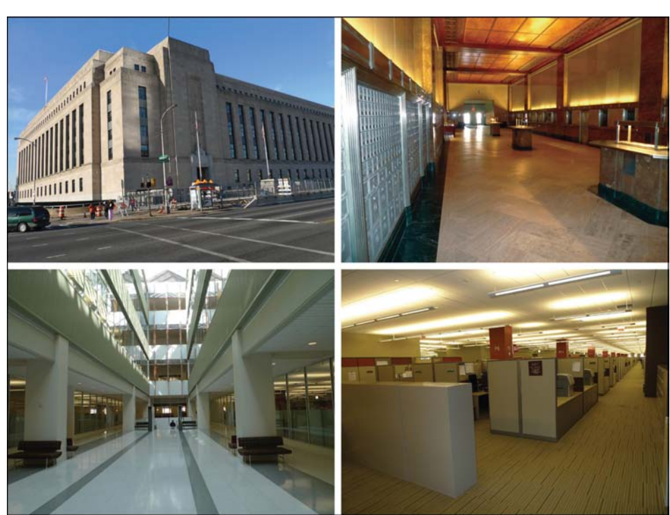
Figure 6: The Former Downtown Philadelphia USPS Mail Processing and Distribution Center, Now IRS Offices

A private entity took title of and renovated the 1935 building, and now leases it back to the federal government.