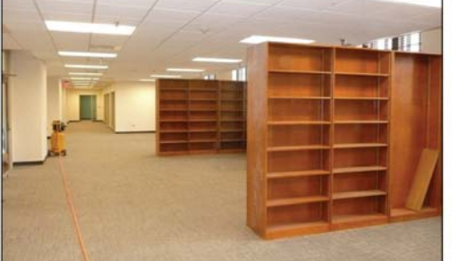
Figure: Condition of Federally Owned Property with Underutilized Space

The federal government owns facilities that are underutilized in locations where it also leases space. In some cases, space within these government-owned properties could be occupied by other government agencies. This is particularly true for the U.S. Postal Service (USPS), for which declining mail volume and operational changes have freed space in many facilities. However, this potential for collocation of federal agencies is affected by such factors as the size, location, and condition of the available space (see figure).