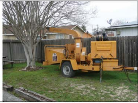
Interior carpentry space to repair historic design elements of Park Service property (left), a cold storage locker (center), and one of Interior's maintenance vehicles stored on-site (right).

Officials from several agencies acknowledged that property knowledge is sometimes communicated informally. However, various officials noted that the lack of a systematic mechanism to share information hinders any efforts to colocate. Officials from a few agencies suggested that structured local or regional coordination could best identify opportunities where the missions of various agencies could be "matched" to appropriate space. Several local officials who showed us vacant federal spaces said there is currently no online or formal mechanism they can use to share vacancy details with officials from other agencies who might need space. A previous effort at local coordination—the Governmentwide