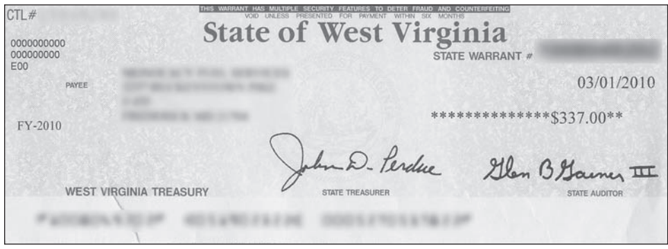
Figure 1: LIHEAP Checks Provided to GAO Based on Bogus Applications

Finally, our proactive testing further demonstrated LIHEAP's vulnerability to fraud. Posing as low-income residents, we used bogus addresses and fabricated energy bills, pay stubs, and other supporting documents to apply for energy assistance in West Virginia and Maryland. For three of the five cases, the LIHEAP payments were made to our fictitious energy company to pay the low-income resident's energy bills. Our investigators created this energy-related company to receive the energy assistance payments. For the other two cases, the low-income residents "lived" in a rental house where the landlord paid the energy assistance benefits as a part of the rent. For these two cases, the investigators created fictitious landlords who received the energy assistance payments. All five claims were processed and the energy assistance payments issued and mailed to our fake company and landlords (see fig. 1).