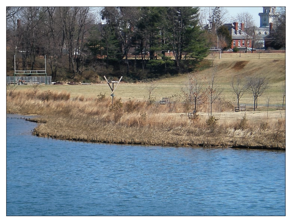
Figure 4: A Living Shoreline, Annapolis, Maryland

This living shoreline uses marsh plants and other natural features to protect the shore from erosion.