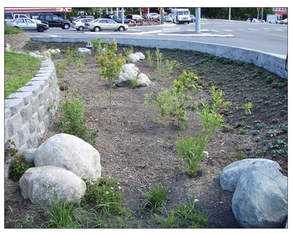
Figure 3: Rain Garden in King County, Washington