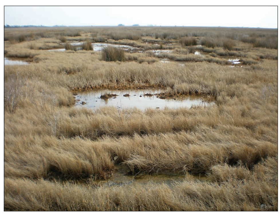
Figure 5: Salt Marsh in Somerset County, Maryland