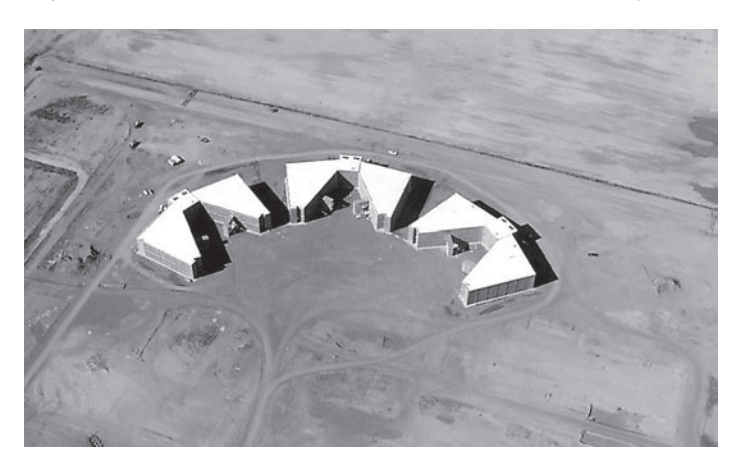
Figure 1: FCI Mendota in California and FCI Forest City in Arkansas