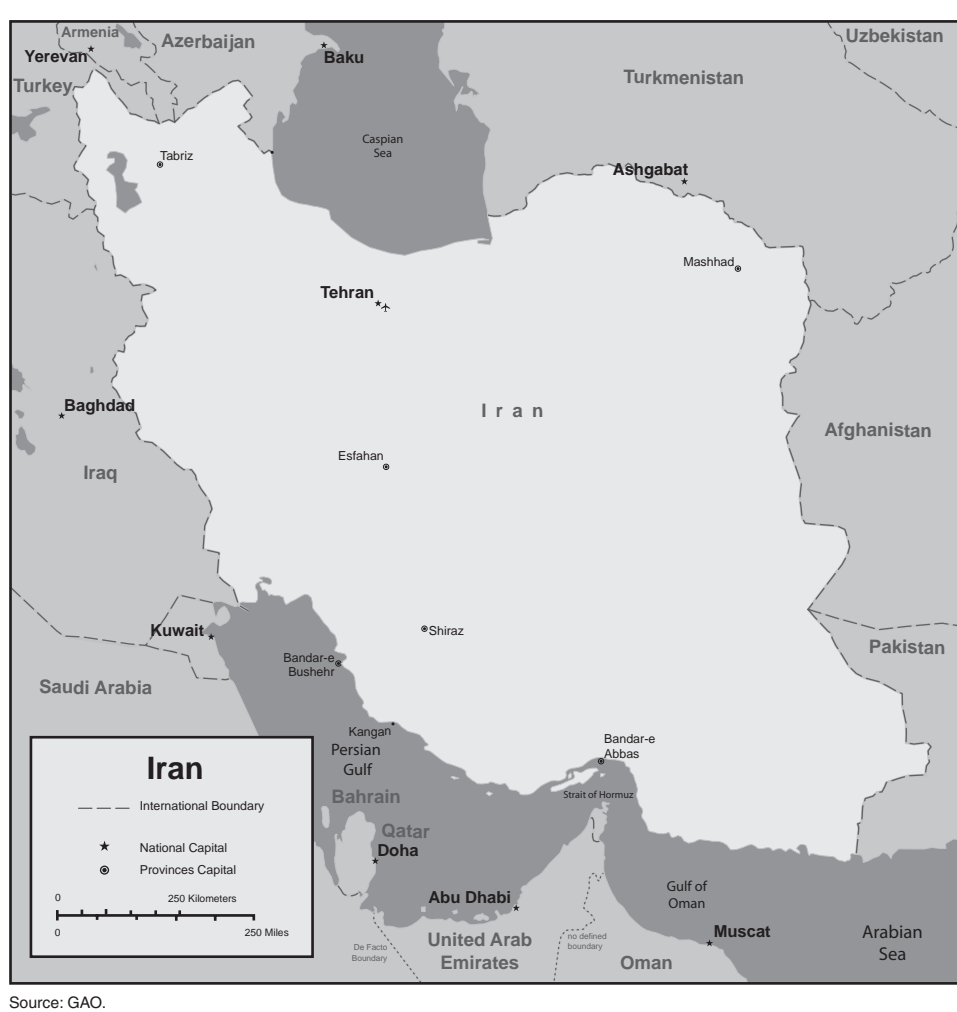
Figure 1: Map of Iran

U.S.-Iranian relations have often been strained since the early years of the Cold War. Following the U.S.-supported overthrow of Iran's prime minister in 1953, the United States and others backed the regime of Shah Mohammed Reza Pahlavi for a quarter century. Although it did much to develop the country economically, the Shah's government repressed political dissent. In 1978, domestic turmoil swept the country as a result of religious and political opposition to the Shah's rule, culminating in the collapse of the Shah's government in February 1979 and the establishment of an Islamic republic led by Supreme Leader Ayatollah Khomeini. In November 1979, militant Iranian students occupied the American embassy in Tehran with the support of Khomeini. Shortly thereafter, the United