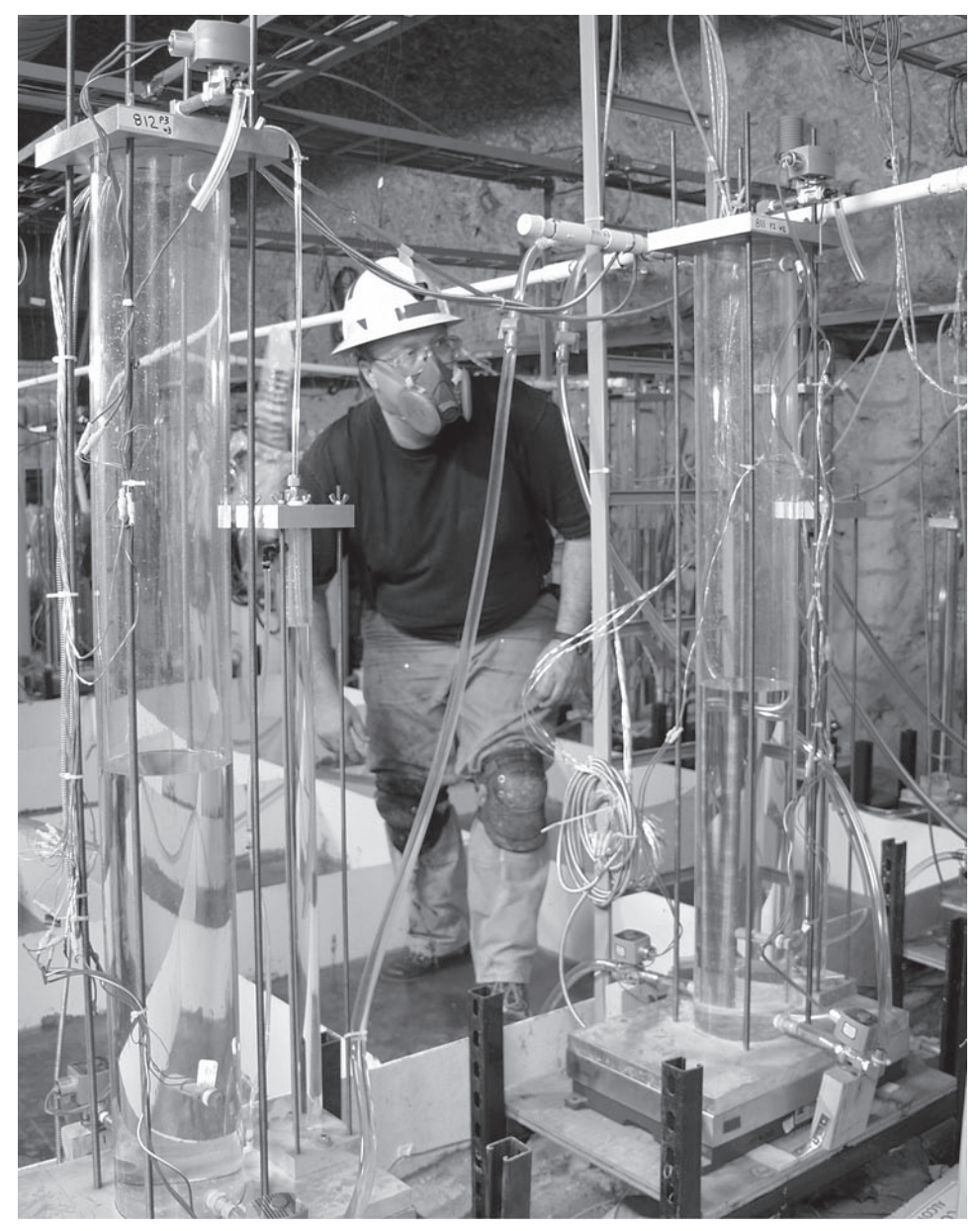
Figure 1: A Yucca Mountain Project Scientist Conducts Water Infiltration Tests inside Yucca Mountain