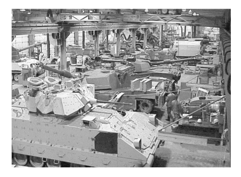
National Guard Maneuver Area Training Equipment Site at Fort Riley, Kansas.