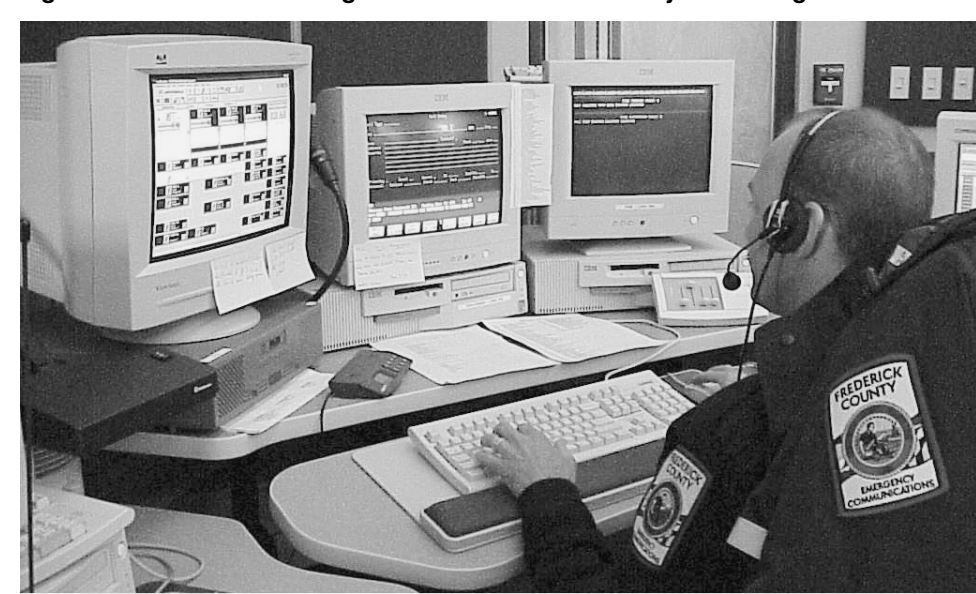
Figure 1: Call Taker Handling a 911 Call at a Public Safety Answering Point

wireline 911 service, and 93 percent of that coverage includes the delivery of a callback number and location information.