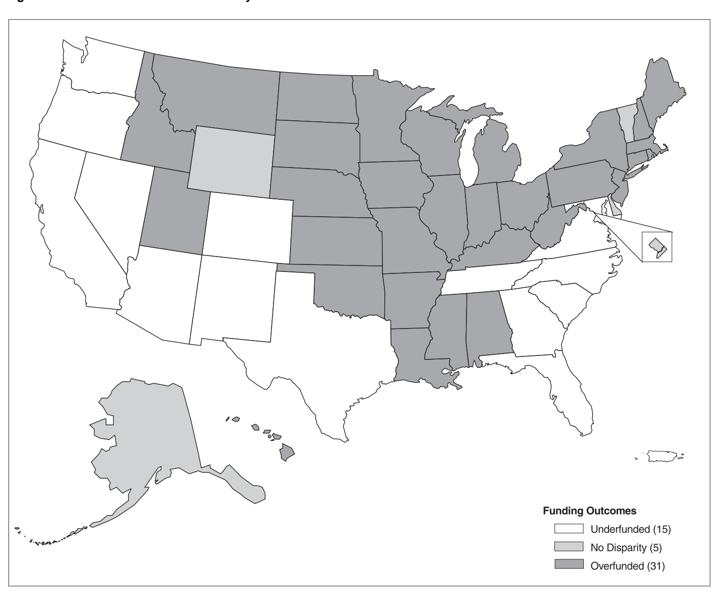
Figure 1: States Under- and Overfunded by AOA's Method