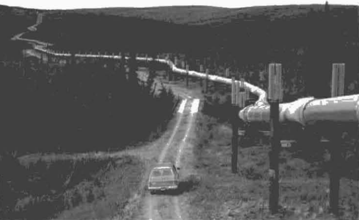
Twenty-five percent of the nation's domestically-produced oil passes through the Trans-Alaska Pipeline (left). This year, GAO studied the ways federal and state regulators could better monitor safety and environmental requirements for the pipeline and the Valdez Terminal.