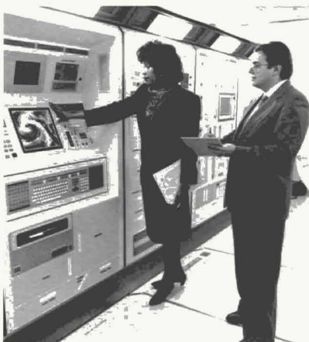
Above, GAO evaluators examine a simulated computer display aboard a mock-up of Space Station Freedom at the Johnson Space Center in Houston, Texas. GAO has been monitoring computer technologies to be used in support of the proposed space station.