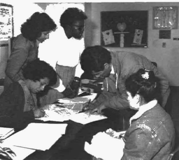
Along with rising costs, access to services is the major problem facing the U.S. health care system. At left, evaluators (standing) from GAO's Boston Regional Office visit a federally funded clinic offering free after-hours immunizations to the public in Washington, D.C.