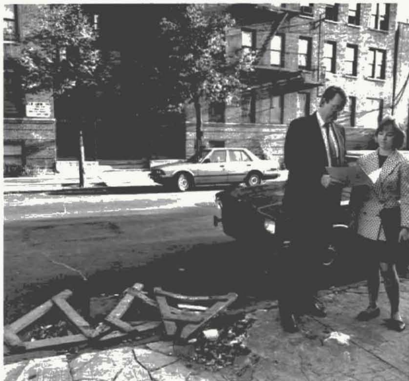
Above, a member of GAO's Office of Special Investigations (OSI) confers with a New York Regional Office staff member on OSI's inquiry into real estate appraisals supporting loans purchased by the Federal Home Loan Mortgage Corporation.