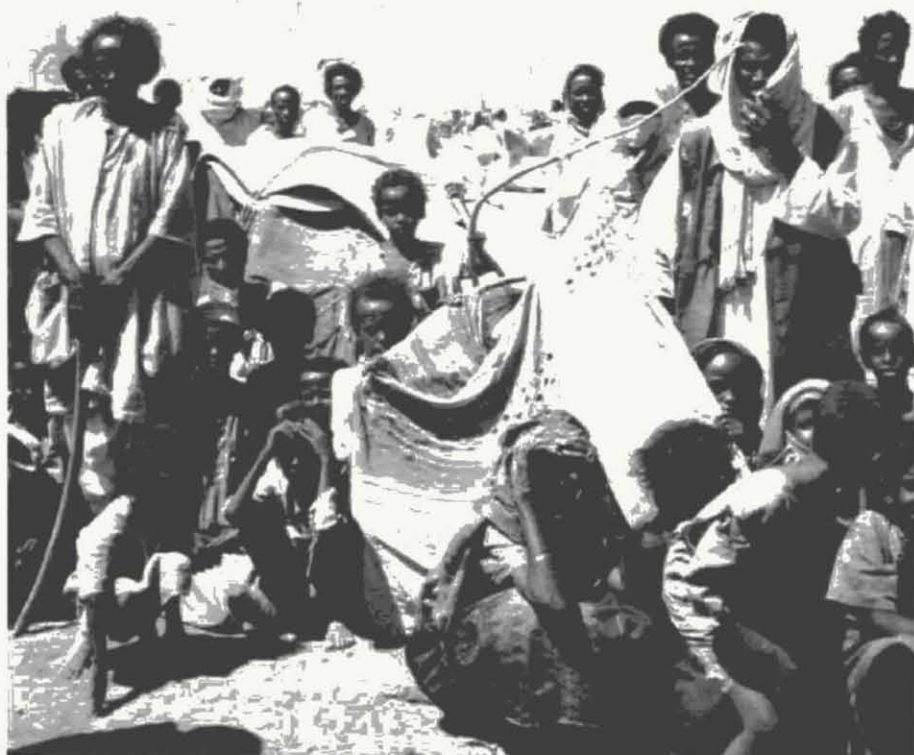
At left, unassisted Ethiopian refugees living in makeshift shelters in Sudan. This year, GAO evaluators travelled to refugee camps in Ethiopia, Sudan, Guinea, Malawi, Malaysia, Pakistan, Northern Iraq, and Turkey as part of their review of assistance to and living conditions of refugees around the world.