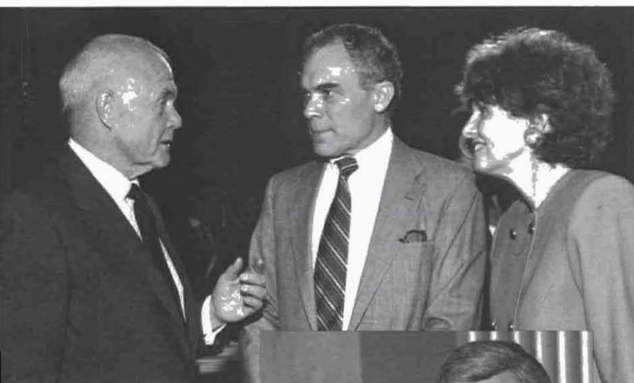
Above, Senate Governmental Affairs Committee Chairman John Glenn discusses U.S. health-care mat- ters with Assistant Comptroller General for Human

“THIS YEAR, GAO CONTINUED TO PURSUE ITS MISSION “TO ACHIEVE HONEST, EFFICIENT MANAGEMENT AND FULL ACCOUNTABILITY THROUGHOUT GOVERNMENT.””