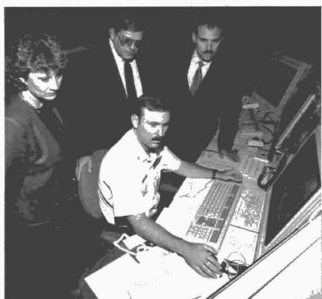
As part of their work on federal anti-drug programs, staff from the National Security and International Affairs Division and the Information Management and Technology Division (above) observe air traffic intelligence activities carried out by the U.S. Customs Service and the U.S. Coast Guard south of Miami, Florida.