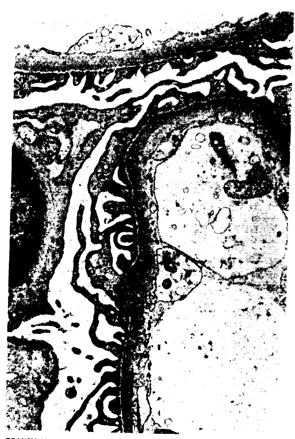
TRANSMISSION ELECTRON MICROPCRAPH OF PORTION OF A KIDNEY. THIS VIEW OF THE SAME KIDNEY AS NOTED ON PAGE 4, IS MAGNIFIED 13,500 TIMES. TRANSMISSION ELECTRON MICROSCOPY SUPPLIES DETAIL AND REVEALS STRUCTURES NOT VISIBLE IN SCANNING ELECTRON MICROSCOPY.