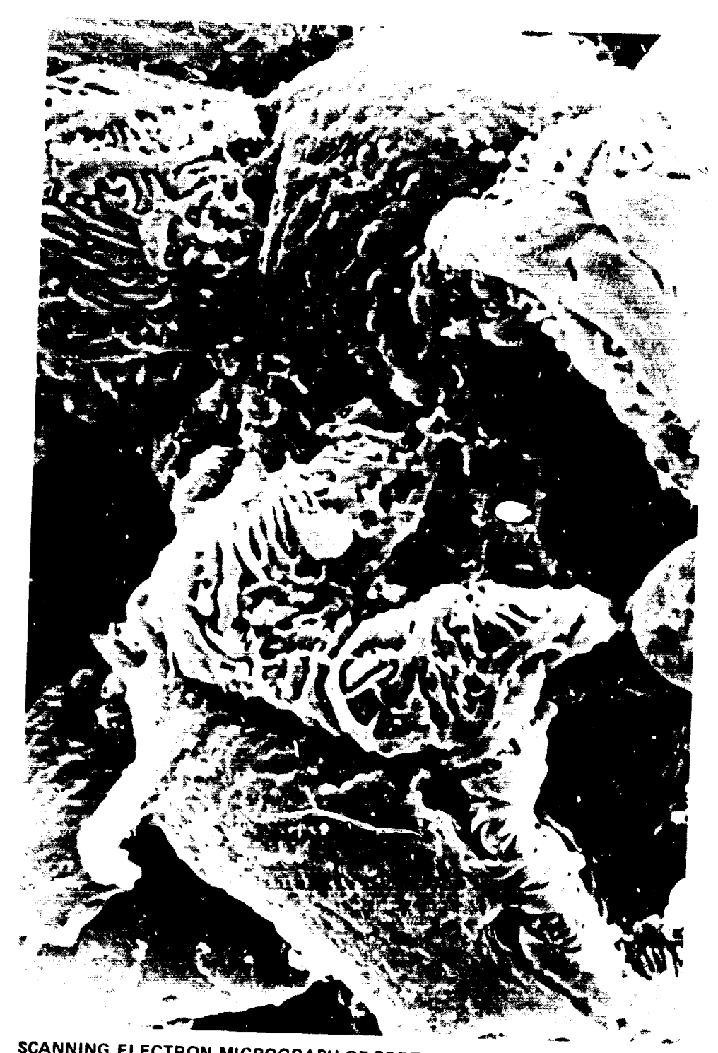
SCANNING ELECTRON MICROGRAPH OF PORTION OF A KIDNEY. SCANNING ELECTRON MICROSCOPY DEPICTS THIS PORTION IN A THREE DIMENSIONAL MANNER.