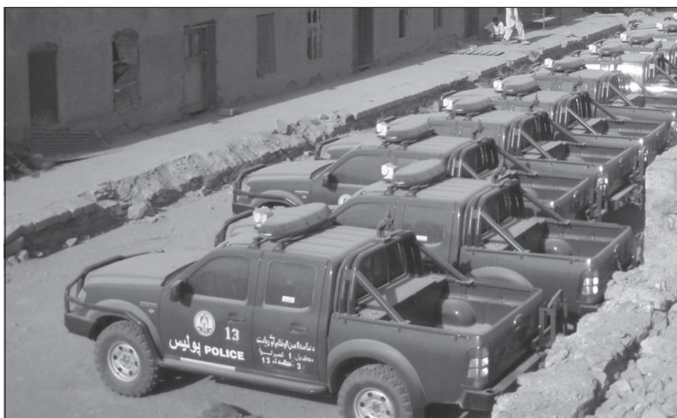
Figure 2: Trucks Awaiting Distribution to ANP

districts' property officers are first trained. For example, according to Defense, more than 1,500 trucks have been on hand and ready for issue since late 2007 (see fig. 2), but the Afghan Minister of Interior has delayed distribution of these vehicles until adequate accountability procedures are established in the target districts.