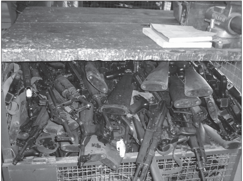
Figure 1: Donated Rifles of Variable Quality