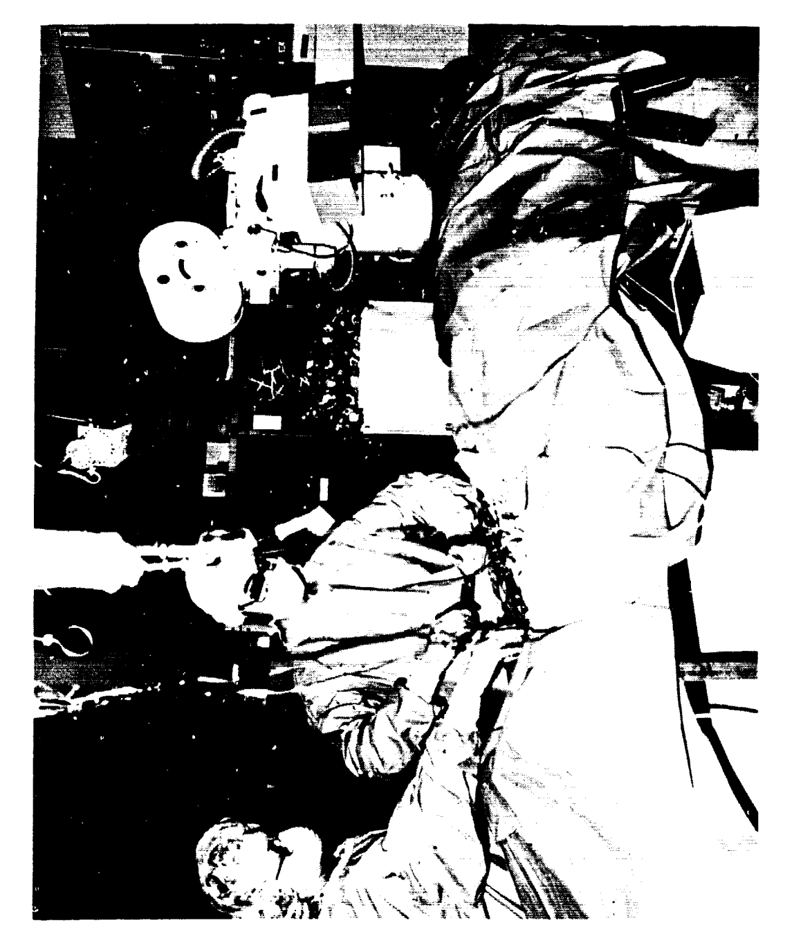
PATIENT UNDERGOING A CARDIAC CATHETERIZATION PROCEDURE