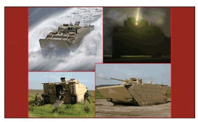
Figure 1: Expeditionary Fighting Vehicle