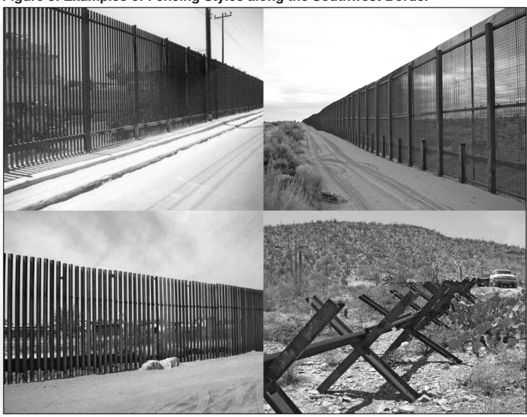
Figure 3: Examples of Fencing Styles along the Southwest Border