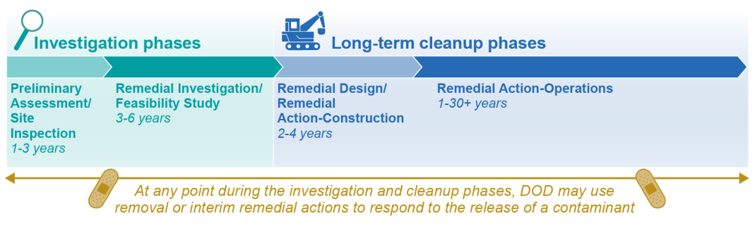
Figure 3: Phases of Department of Defense's (DOD) Environmental Restoration Process

Source: Department of Defense (DOD); GAO (icons). | GAO-24-106812